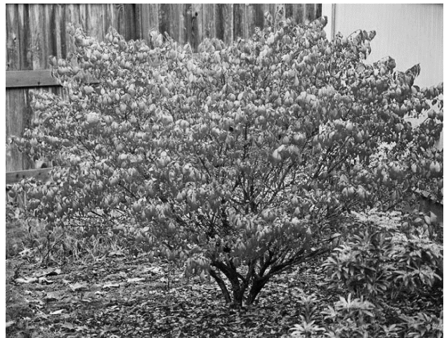
Imagine a shocking pink colour...

The summer flowers are small, but they result in attractive purple and red fruits which split open to form four winged lobes with a bright orange seed at the centre. The bark is also attractively winged and very unusual. It's a great specimen shrub in a mixed border or front garden, where its magnificent autumn colours can really be appreciated. I have one in my garden and it is a plant I wouldn't be without especially at this time of the year.