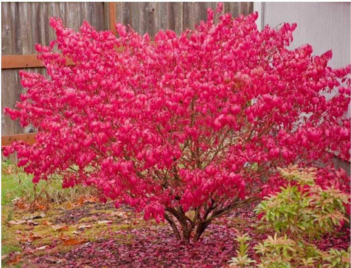
Gardener Steve's Plant of the month – see page 26 – in glorious colour