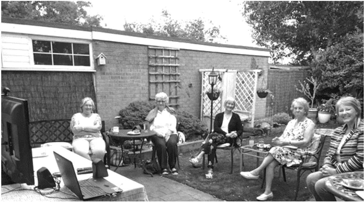
A group of our members attending a Zoom speaker meeting

Our informal meetings, in the gardens of some of our members, continue with the fine weather and is a welcome escape from the confines of our own homes.