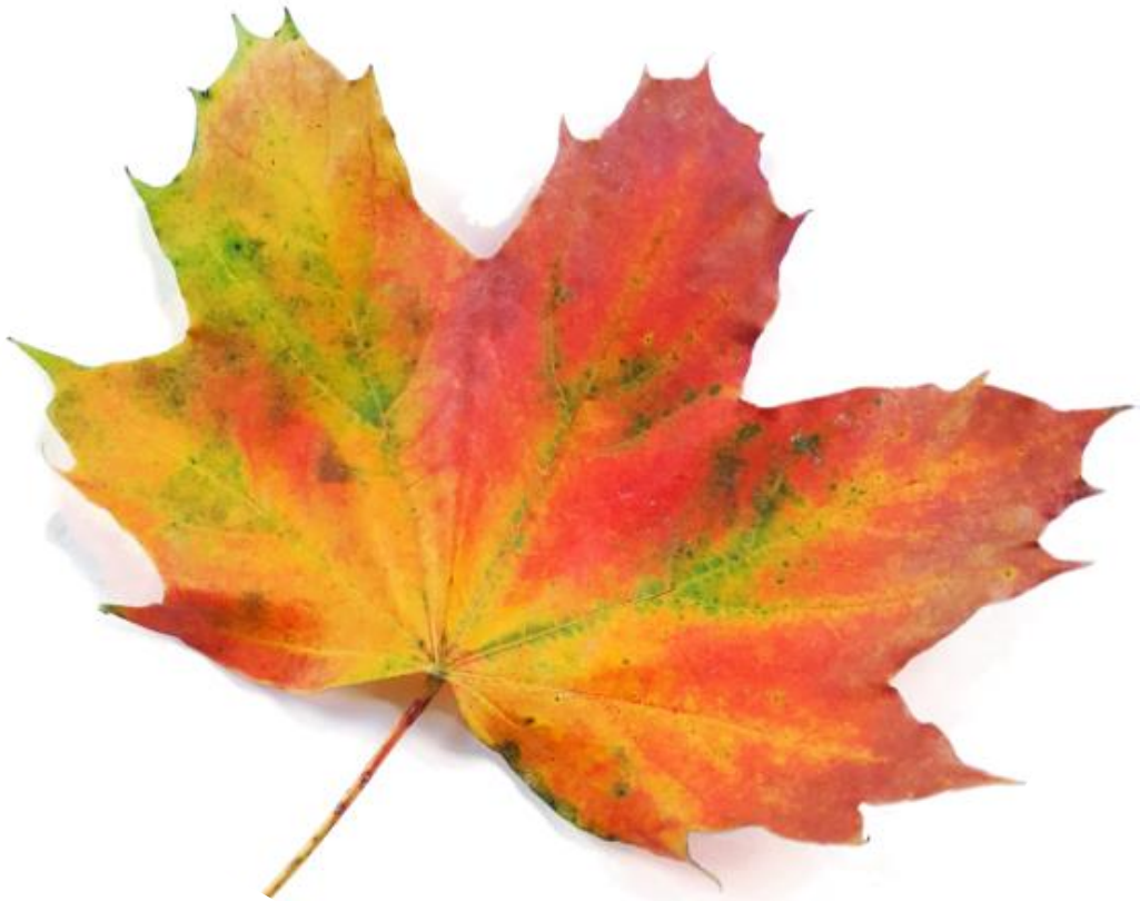
Autumn colours captured in Duffield Close